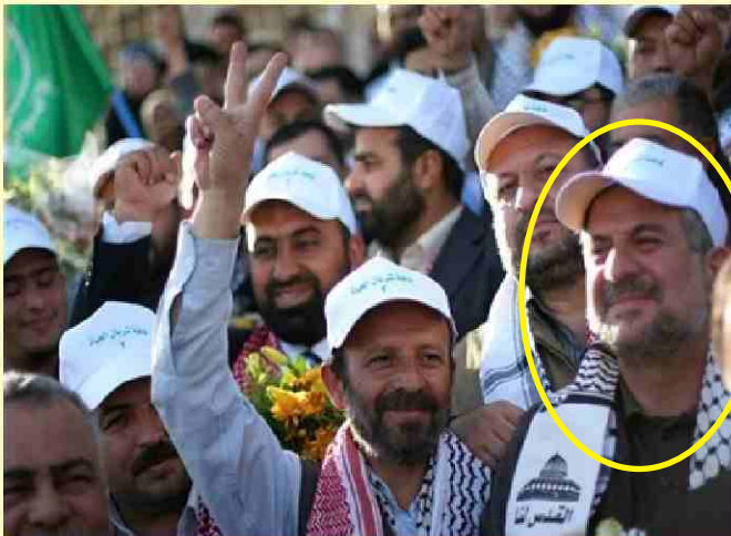
George Galloway, the legendary British MP greeted by the Palestinians in Gaza.

The march stirred the hearts of thousands and gave hope to millions around the world. The contributions made by the aforementioned organizations can help to change the destiny of those who are affected in one way or the other. This shows that it is never too late to seek a newer world and those who make history are ordinary people like us.