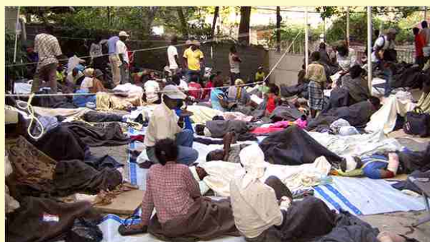
Thousands of shelter less affectees of earth quake in Haiti.