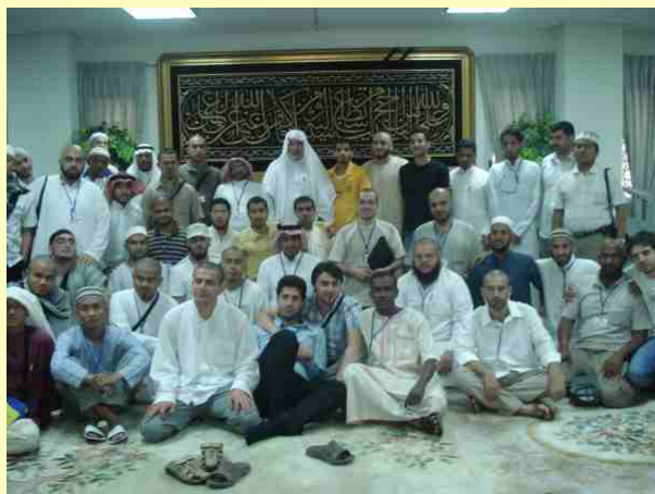
Visiting Quran Printing Complex, Almadina

· IMAKSA or WAMY unfortunately CANNOT secure visas for the participants. However, an invitation letters can be issued from IMAKSA, WAMY only if it is requested at least 2 months earlier ( Deadline for requesting invitation letter from WAMY is 15 Feb 2010 ).