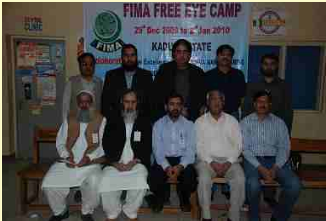
The team of Eye surgeons from Pakistan who participated in the recent camp held in Nigeria