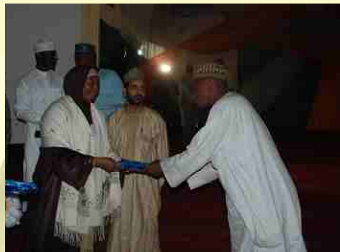
The First Lady of Nigeria presenting a memento to a FIMA Doctor.

After three days of thorough discussions in various groups a preliminary strategic document was prepared and approved by all