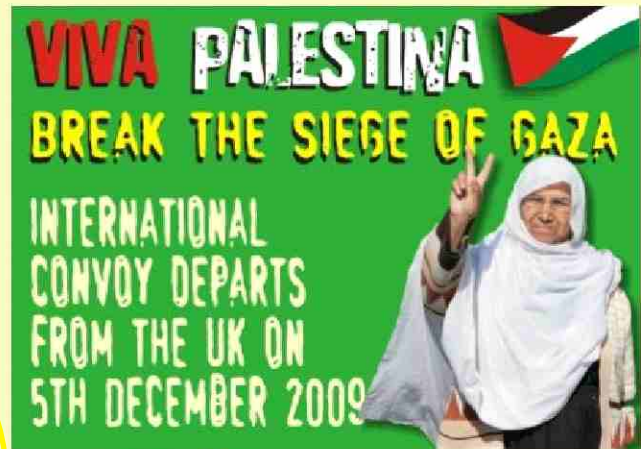
Poster depicting Aid Convoy to Gaza.