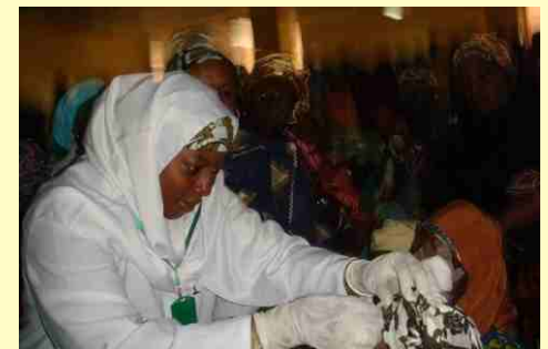
An ophthalmic Nurse preparing a young patient with congenital cataract for surgery.