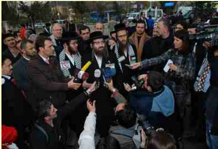
Jewish community in Turkey came out to express solidarity with the Palestinians