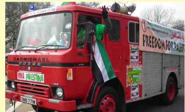
One of the Trucks loaded with medical supplies.