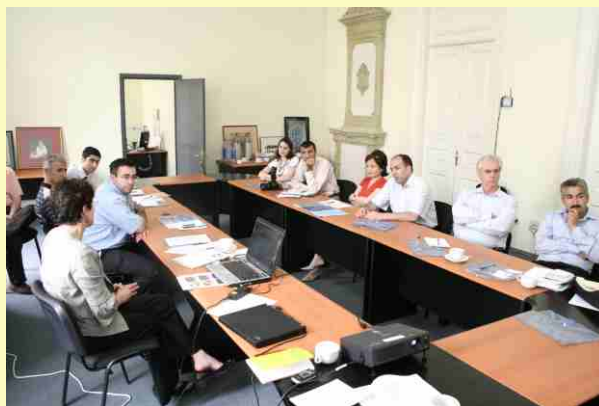
International Workshop and Training "Improving Dialogues for Research Ethics Education", held by Azerbaijan Medical Association

In 2000, AzMA established its Ethics Committee as one of first permanent committees which is responsible for the preparation of the Association's ethical rules and regulations. In 2000, the committee adopted Code of Medical Ethics for its physician members. Code of Ethics has been revised twice, once in the year 2002, and again in 2008. The Ethics Committee is active in organizing seminars, conferences. In 2002, the committee published a book "Ethical principals in Medicine" education for Medical University students. In 2004, AzMA host and organized the International conference "Health Legislation in Human Rights Protection and Access to Medicines in Health Research in the NIS countries" with cooperation and support of National Parliament and FECCIS. On 17-21 June, AzMA organized International Workshop and Training "Improving Dialogues for Research Ethics Education", with the cooperation of EGCP, SIDGER.