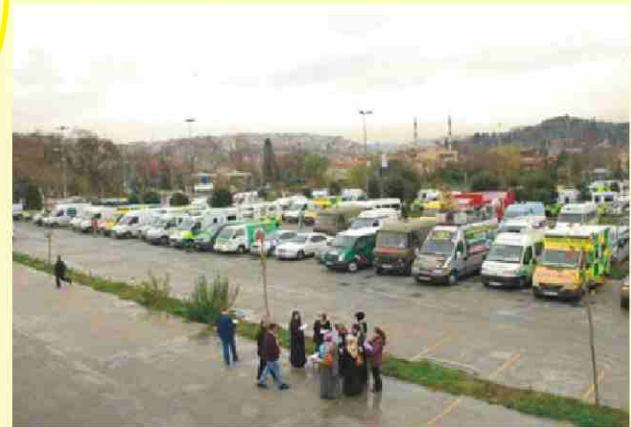
A fleet of ambulances bound for Gaza.