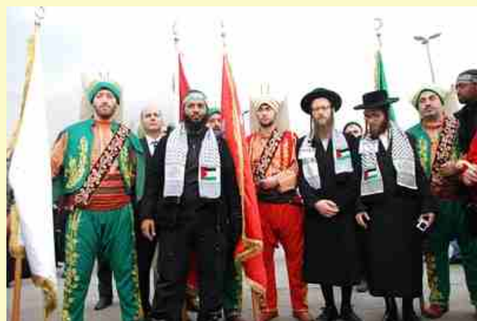
Christian & Jewish community leaders welcoming the Viva Palestina convoy in Turkey.

Malaysia collaborated with Viva Palestina on this convoy in a unique way. Malaysia's contributions were coordinated by VP-Malaysia. The funds largely came from Viva Palestina-Malaysia, Muslim Professionals Forum (MPF), PACE (Palestine Centre of Excellence), FIMA (Federation of Islamic Medical Associations) IMA Malaysia and numerous individual local contributors.