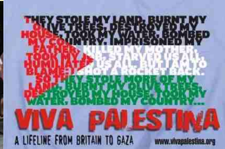
Viva Palestina - A life line from Britain to Gaza.

Lights glowed on the streets of Gaza on January 6th as hundreds of vehicles, mostly ambulances and trucks over loaded with piles of medicines, food items, life saving drugs and other medical ancillaries appeared. The wet eyed motorists were testifying their commitment to the cause of humanity by chanting slogans of friendship. They were overjoyed to break the siege of oppression and tyranny and on their accomplishment to help the victims of Gaza holocaust; spearheaded by the Briton MP George Galloway (Respect party from Bethnal, green and Bow). The third 'Viva Palestina' convoy departed London on 6th December in an effort to offer a 'lifeline' to the people of Gaza. 220 vehicles were part of this convoy. Viva Palestina (UK) is a registered charity with branches in many countries of world, its objective is twofold: to provide food, medicine, essential goods and services needed by the civilian of wars with a view to achieving peace and was a resultant response to the 2008-2009 Israeli invasion of Gaza.