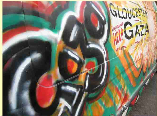
An ambulance from Gloucestershire heading to Gaza.